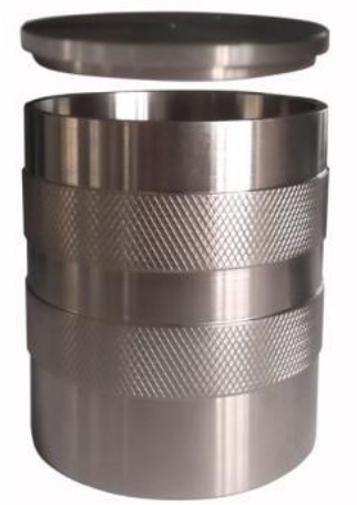
(图一) 样品杯结构图 1 样品杯盖 2 样品杯体