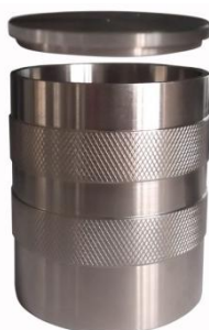
Fig. 1 The structure of sample cup 1----- The cap of sample cup 2-----The body of sample cup