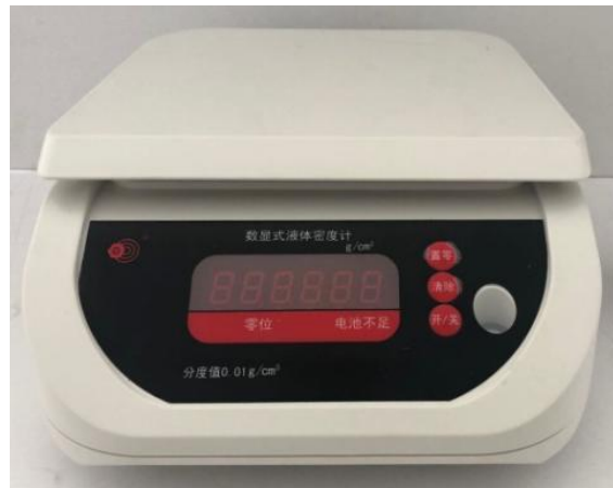
Fig. 2 Structure of controlling panel